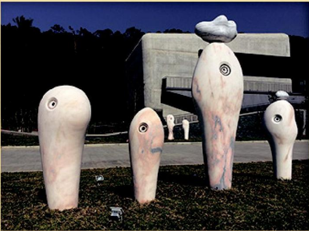
On Alishan , due to temperature changes due to the terrain , the Forest are also many levels , and gave birth to a variety of birds in this habitat , many professional photographers or bird watchers are Ali came to see their beautiful figure. The Corridor will endemic birds and the best birding sights introduced to the visitors know that traces of birds more Alishan show in the world .